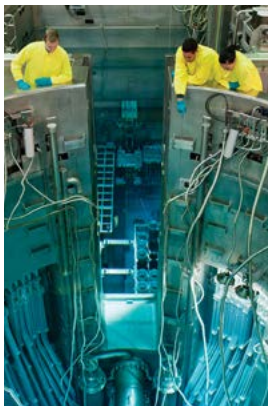
The Open Pool Australian Light-water (OPAL) reactor.