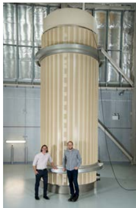
The TN-81 Intermediate-level waste canister.