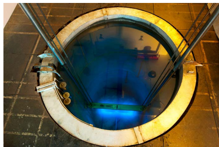
ANSTO's Gamma Technology Research Irradiator (GATRI).

The nominal dose rate is around 550Gy/hour but decreases over time. The dose rate in the Gammacell cannot be varied and maximum sample dimensions are much smaller. Online testing is easy to perform.