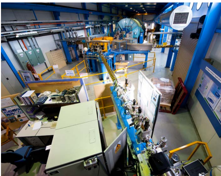
ANSTO's 10MV ANTARES accelerator.

The Centre for Accelerator Science acquired an acid jet decapsulation system to improve its irradiation of commercial off-the-shelf (COTS) chips. The system can expose the die and bond wires of most plastic integrated circuit (IC) packages, while leaving the chip and its die in a fully functional state.