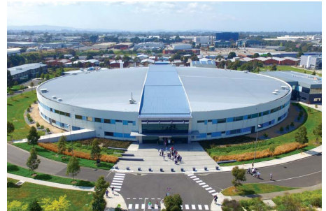
ANSTO's Australian Synchrotron in Clayton, Vic.

Tomosynthesis delivers a series of images with a limited range of angles of the chip or circuit. This technique provides better than 1% accuracy on the depth of easily visible features in the integrated circuit.