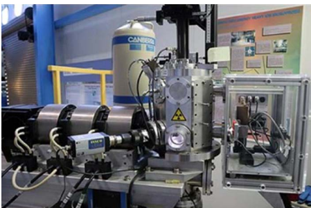
ANTARES external in air beam.