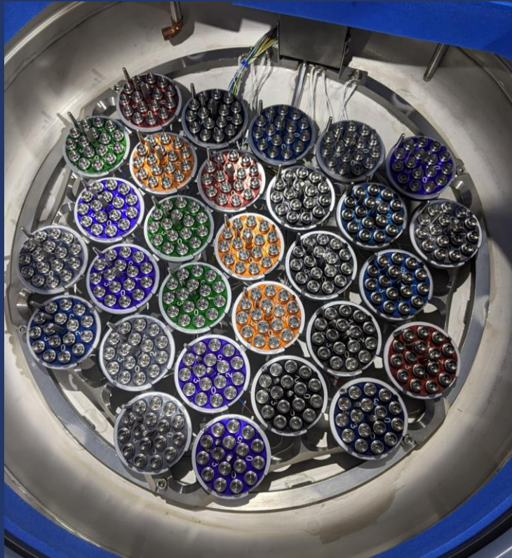
The MX3 robot dewar fully loaded with 464 test sample holders.

Integrating and testing the MX3 endstation components is proceeding at pace. All major elements that will form the endstation are already talking to each other and taking (mock) data.