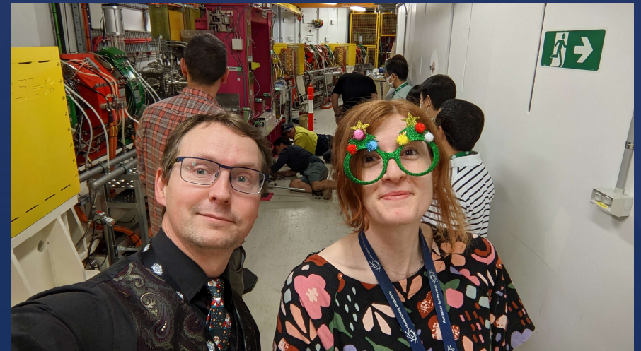
MX scientists' Christmas spirit while expert technicians and engineers install and level the insertion device